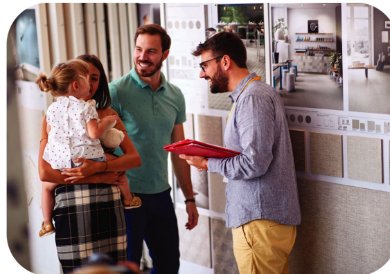
Discover Your Wants and Style