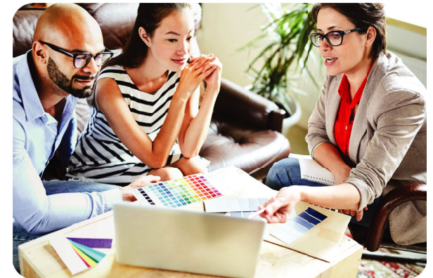
Develop the Design